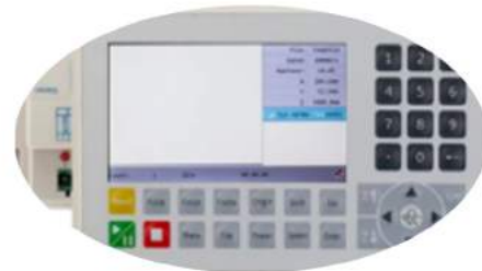
Ruida Control card and panel