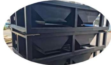
High strength integrated bed