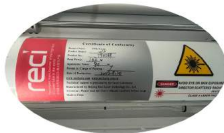
RECI brand wiht best in China