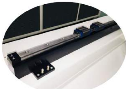
High precision famous linear guide